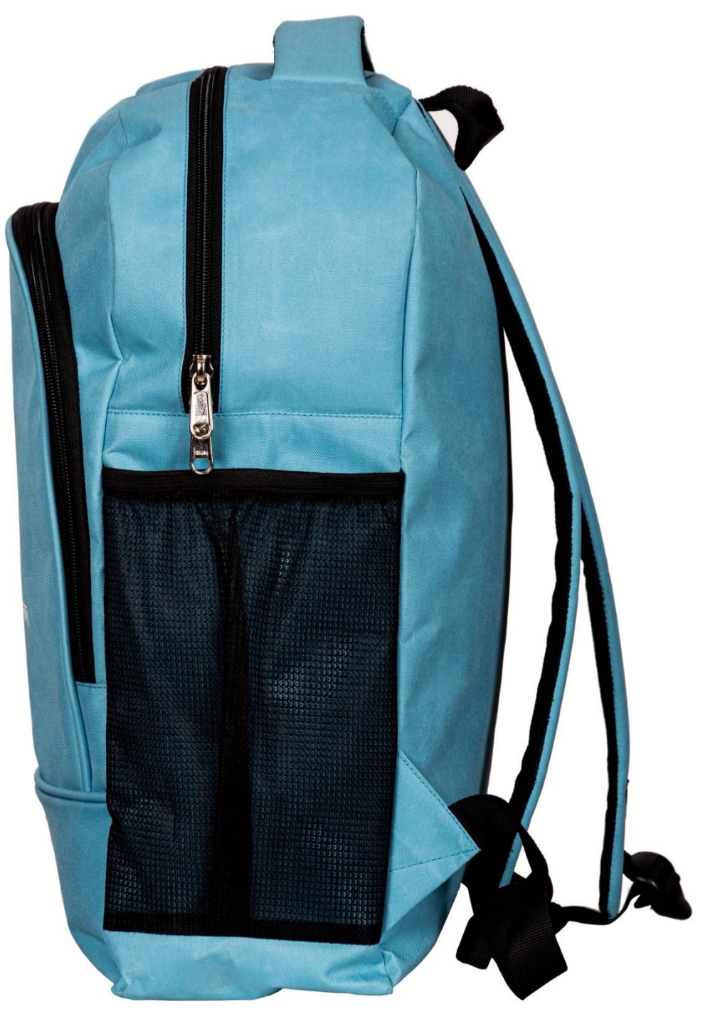
SIDE VIEW - 2

IMPORTANT NOTE: THE ABOVE PICTURE/ IMAGE MAY NOT REVEAL THE TRUE COLOURS/ SHADES AND THE EXACT TONE, AND ALSO THE LOOK AND FEEL OF THE REFERENCE SAMPLE OF THE BAG AS APPROVED BY THE COMPETENT AUTHORITY IN THE GOVERNMENT OF WEST BENGAL.