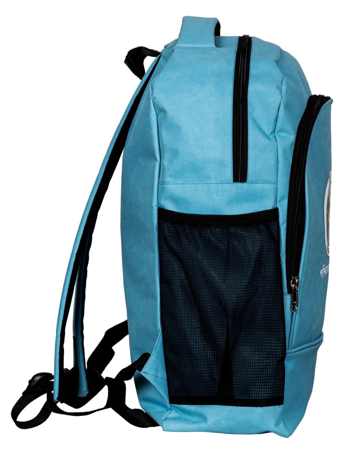
SIDE VIEW - 1

IMPORTANT NOTE: THE ABOVE PICTURE/ IMAGE MAY NOT REVEAL THE TRUE COLOURS/ SHADES AND THE EXACT TONE, AND ALSO THE LOOK AND FEEL OF THE REFERENCE SAMPLE OF THE BAG AS APPROVED BY THE COMPETENT AUTHORITY IN THE GOVERNMENT OF WEST BENGAL.