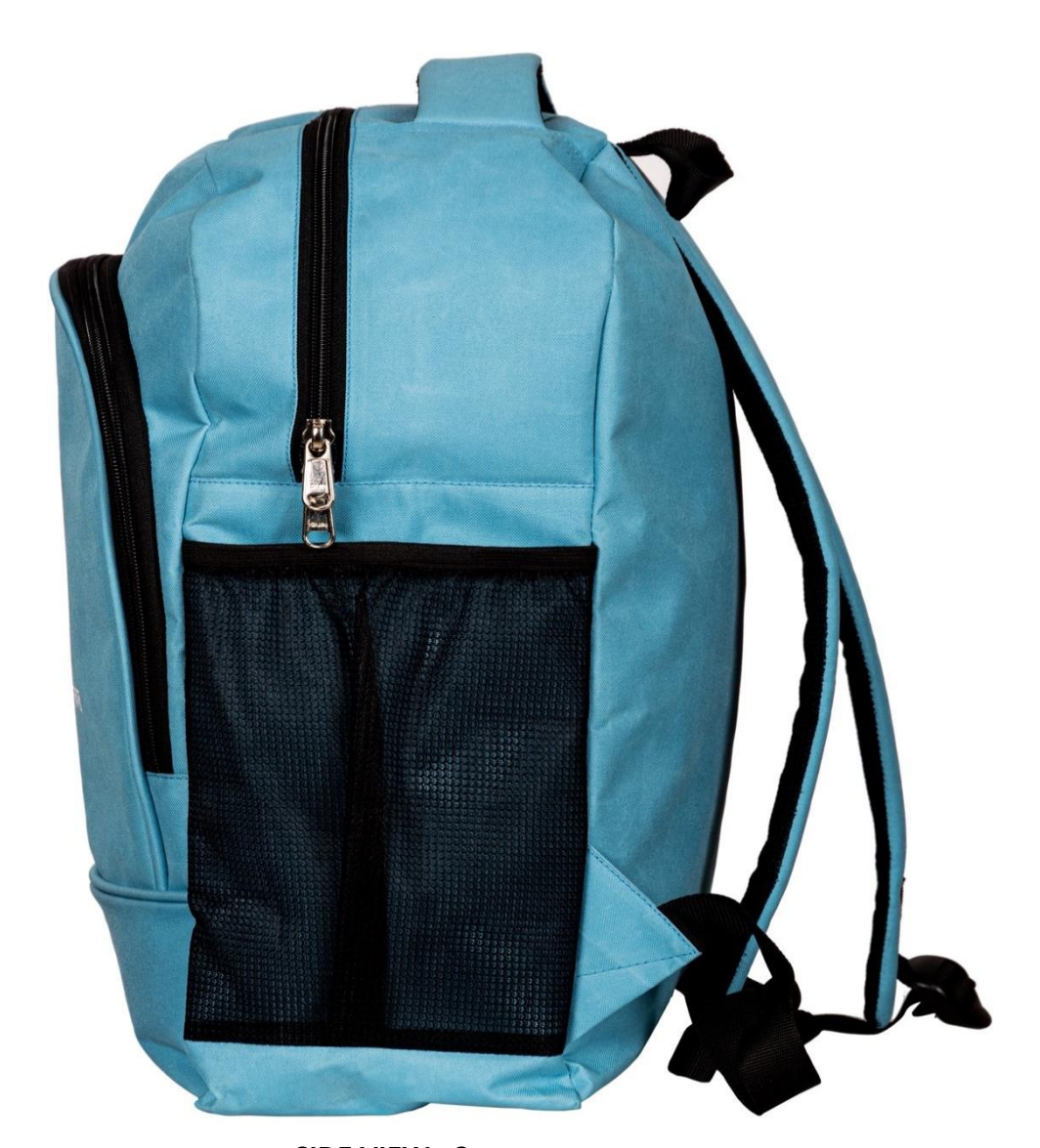
SIDE VIEW - 2

IMPORTANT NOTE: THE ABOVE PICTURE/ IMAGE MAY NOT REVEAL THE TRUE COLOURS/SHADES AND THE EXACT TONE, AND ALSO THE LOOK AND FEEL OF THE REFERENCE SAMPLE OF THE BAG AS APPROVED BY THE COMPETENT AUTHORITY IN THE GOVERNMENT OF WEST BENGAL.